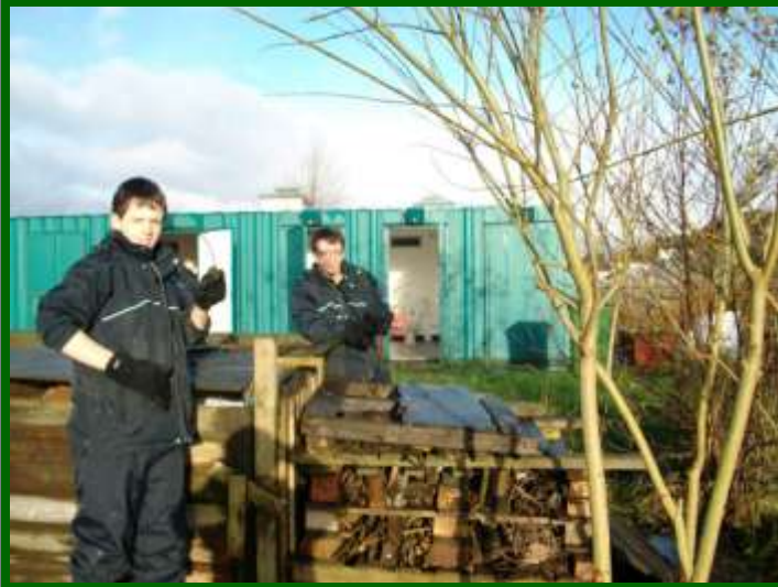
Anniesland Students working on the new bug hotel